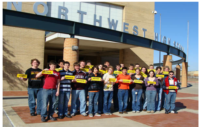
You can find this article at http://www.eham.net