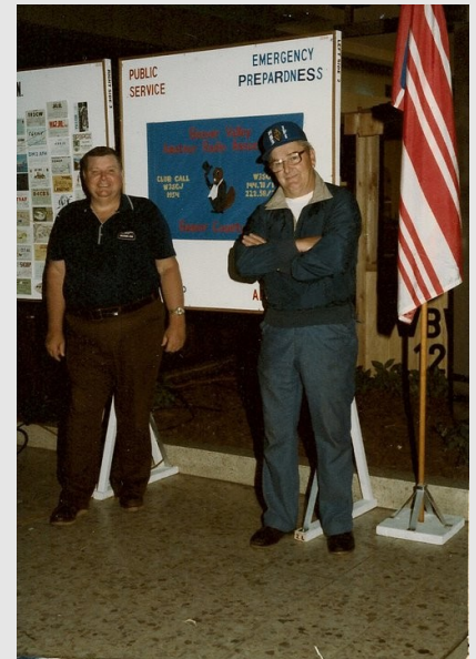
BLAST from the PAST! Image DE Adam, KG3L