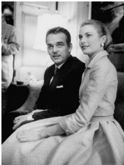
Grace Kelly and Prince Rainier of Monaco

credit card was introduced. That same year President Truman ordered construction of the Hydrogen bomb. In December 1952 the Great Smog killed nearly 12,000 people in London. In 1953 the first issue of Playboy Magazine appeared. Edmund Hillary and Tensing Norgay succeeded in climbing Mt Everest. Julius and Ethel Rosenberg were executed for espionage against the US that same year. In 1954 the British launched an expedition to search for the Abominable Snowman. That same year the Nautilus Nuclear-powered submarine was launched. In 1955 Disneyland was opened and the McDonald's Corporation was founded. In 1956 Elvis gyrated on the Ed Sullivan TV show, Grace Kelly married Prince Rainier of Monaco, and the Hungarian Revolution and the Suez Canal crises dominated world events. In 1957 Dr. Seuss published The Cat in a Hat. In 1958 Boris Pasternak refused to accept the Nobel Prize, Chinese leader Mao Zedong launched "The Great Leap Forward." That same year NASA was founded and the Lego brick was introduced. In 1959 Castro became dictator of Cuba and The Sound of Music opened on Broadway.