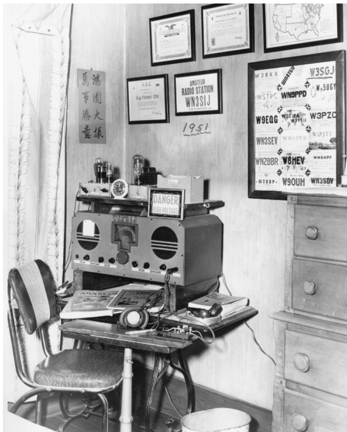
Eddie Woodson, WN3SIJ's novice station