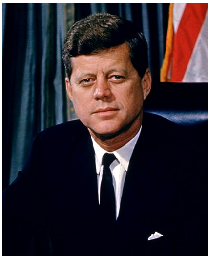
President John F. Kennedy, the 35th US President

In 1960 the first televised presidential debates began and in that same year, a U-2 spy plane