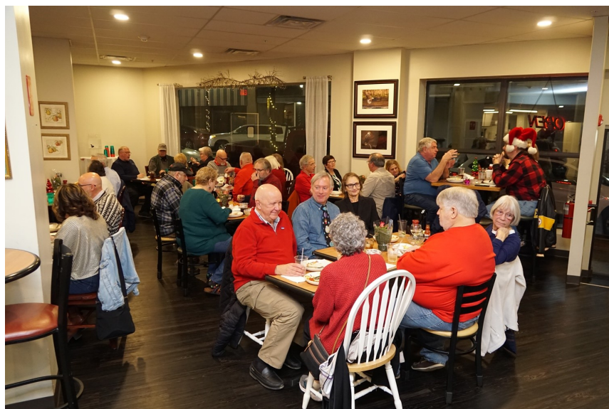
And a good time was had by All!