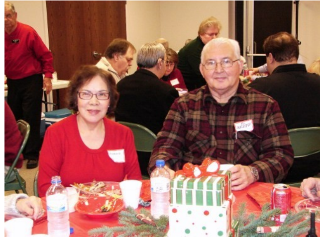
Chang & WA3GFM-AI