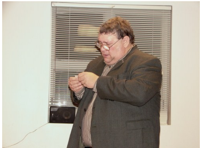
Gift Exchange - These Numbers are Small